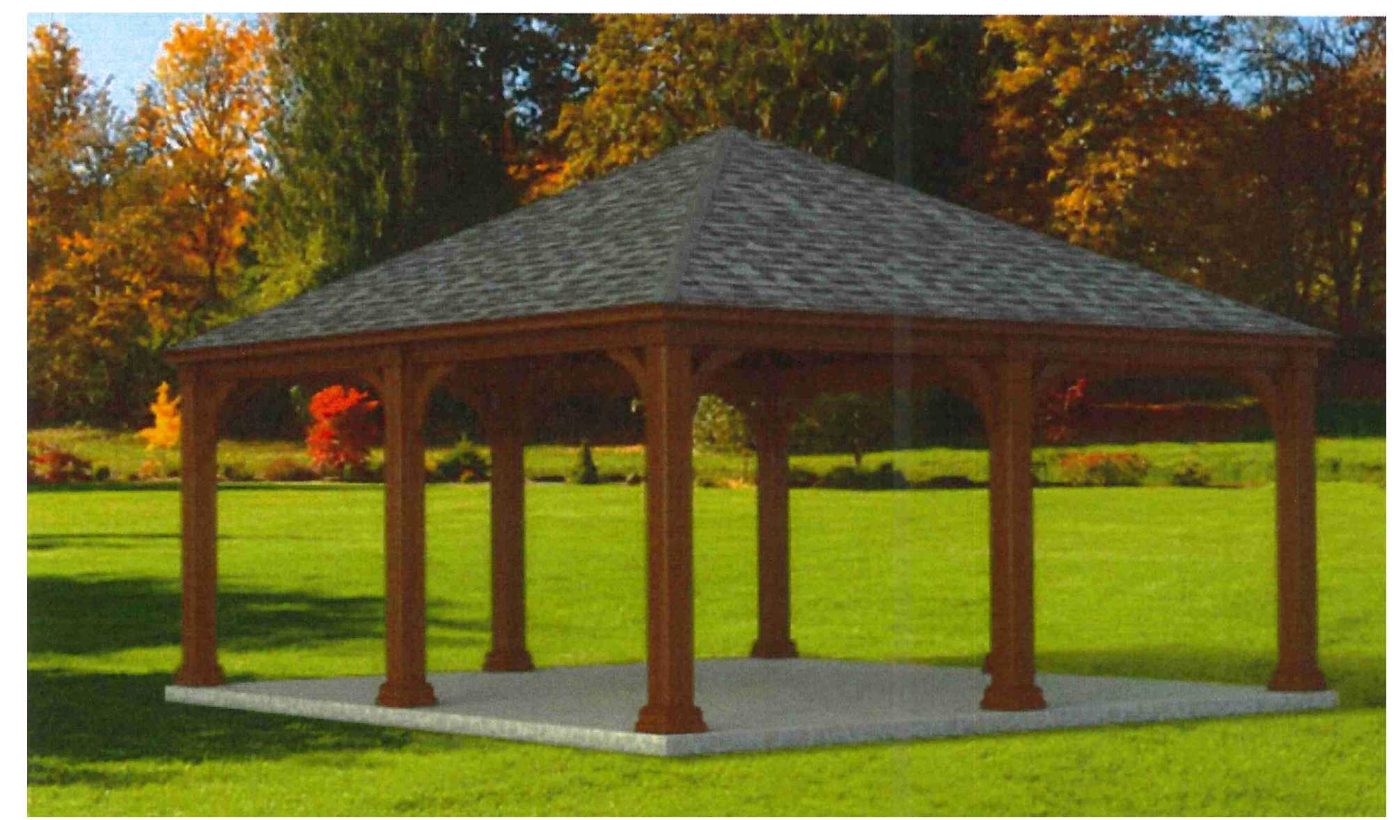
PROPOSED PAVILION RENDERING Scale: None

CONSTRUCTION NOTES: 1. PROPOSED IMPROVEMENTS INCLUDE CONSTRUCTION OF AN OPEN AIR PAVILION WITH A FOOT PRINT OF 20ft x 20ft. SEE PLAN FOR LOCATION AND RENDERING BELOW FOR FINISH CONCEPT.